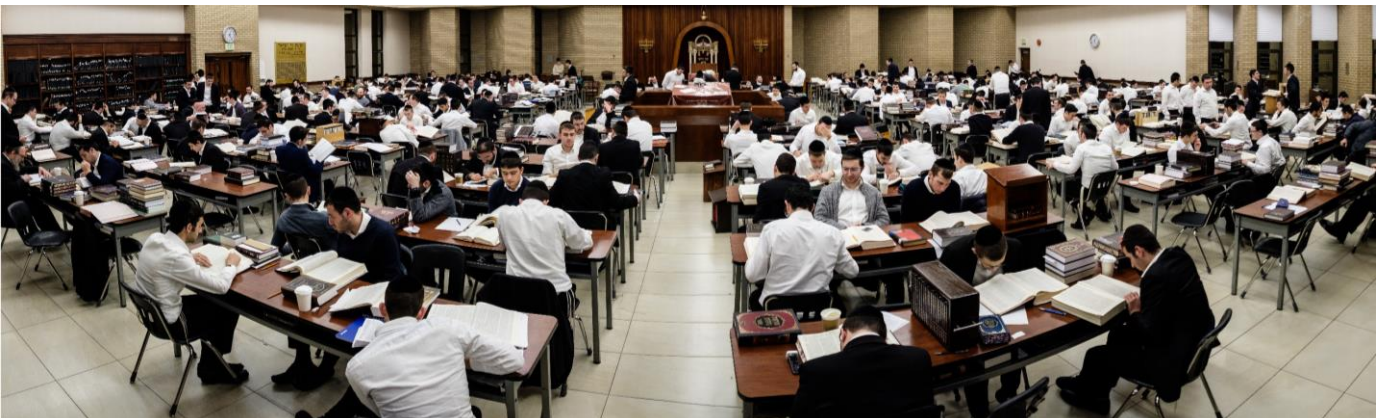
Panoramic View of the Bais Medrash

A candidate for this degree will be required to complete a minimum of 60 credits at Ner Israel. In all cases, the last semester must be completed at this institution.