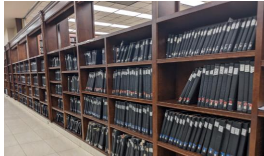
Portion of the library available in the Tanenbaum Bais Hamedrash

The Beren Learning Center also contains a separate audio library. It houses a vast collection of recorded lectures given in Ner Israel by members of our faculty and lectures delivered by other contemporary scholars during the past thirty years. Well over eight thousand audio files are listed in the catalog. The archive of cassette tapes, dating back decades, have been digitized and are now available online.