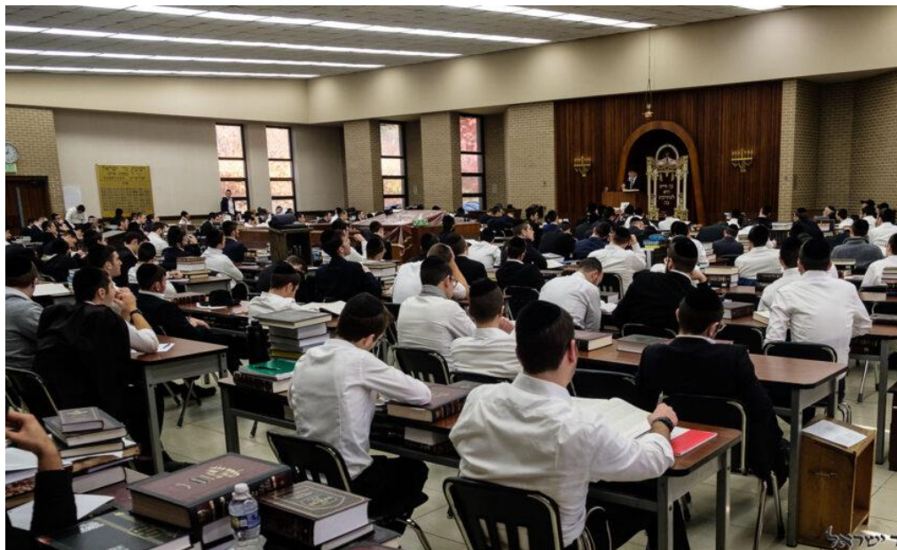
Students Listening to a Lecture in the Tanenbaum Bais Hamedrash