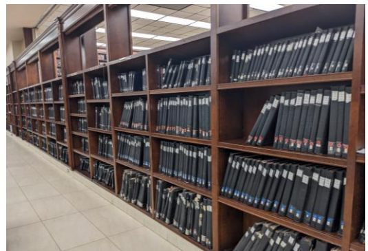
Portion of the library available in the Tanenbaum Bais Hamedrash

A substantial portion of the library collection, which in total contains over 35,000 volumes encompassing the breadth of Torah commentaries and Talmudic research, is shelved in the Bais Hamedrash, with the balance of the collection housed in the Learning Center. The library's open stacks and lengthy hours afford our students easy access to core