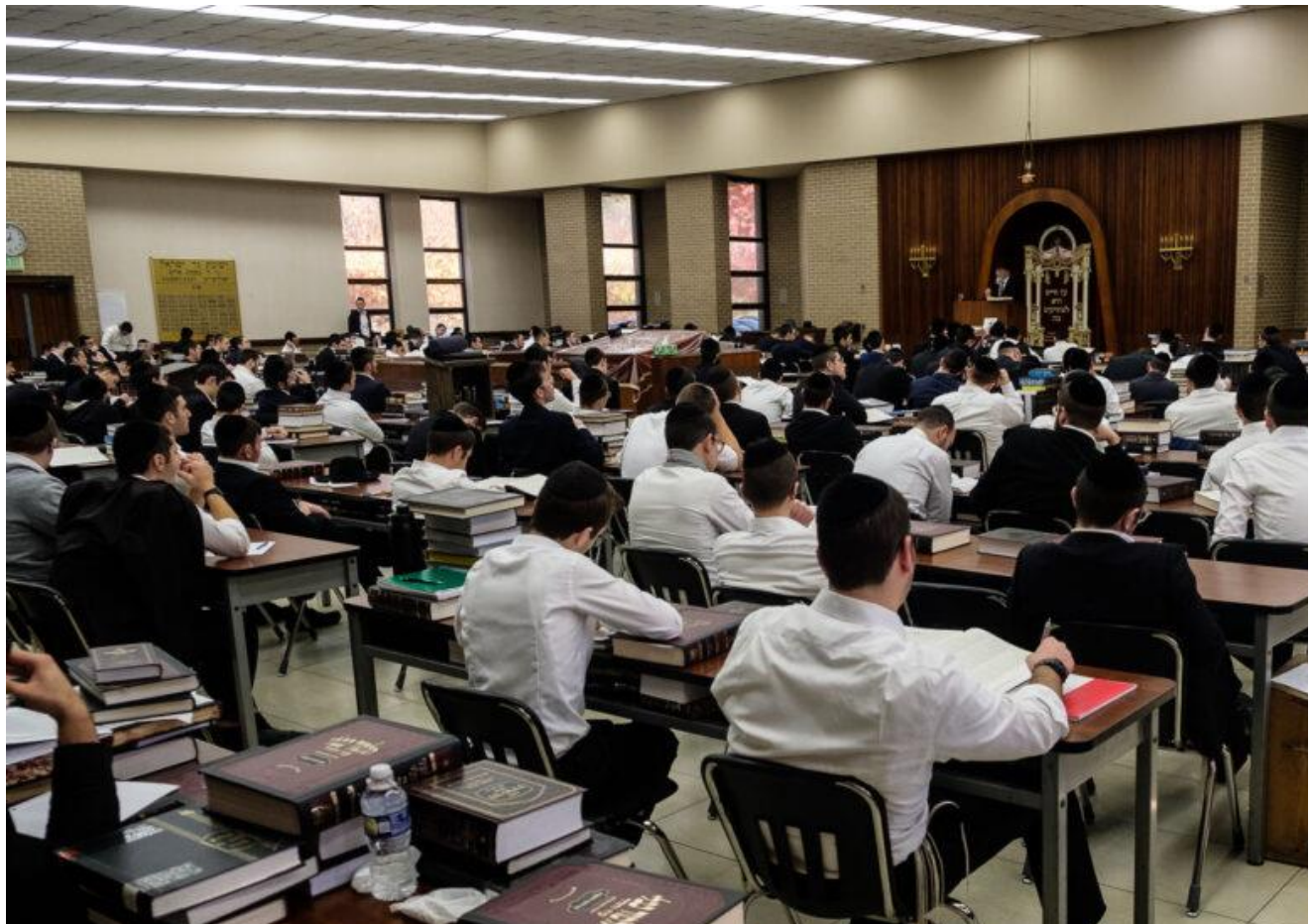
Students Listening to a Lecture in the Tanenbaum Bais Hamedrash

Detailed information regarding meningococcal disease, the availability and effectiveness of any vaccine, as well as an approved waiver are available in the administration building during regular business hours.