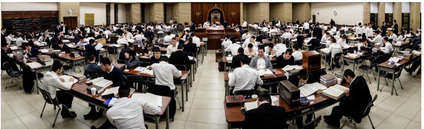
Panoramic View of the Bais Medrash

Students enrolled at Ner Israel take the recommended number of courses offered each term at their grade level and progress toward their degrees in the time frame outlined in the sample curriculum. Course offerings for each semester take into account the needs of the all students, and courses are offered with enough frequency to enable students to graduate within the normal time frames.