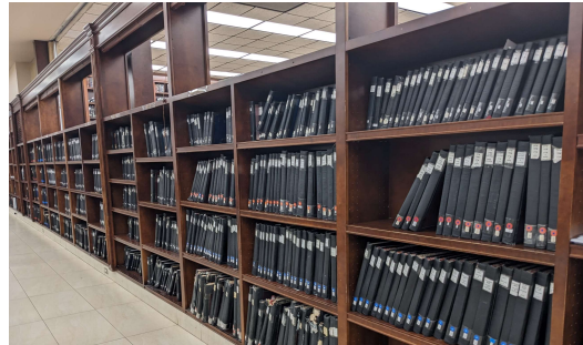
Portion of the library available in the Tanenbaum Bais Hamedrash

The Beren Learning Center also contains a separate audio library. It houses a vast collection of recorded lectures given in Ner Israel by members of our faculty and lectures delivered by other contemporary scholars during the past thirty years. Well over eight thousand audio files are listed in the catalog. The archive of cassette tapes, dating back decades, have been digitized and are now available online.