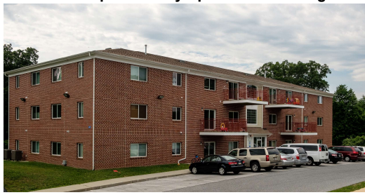
On Campus Faculty Apartment Building

In addition, there is the Hurwitz Educational Building, which contains two additional study halls, classrooms and lecture halls equipped with audiovisual facilities. There are three dormitories, which provide spacious housing for the students. The lower level of the Kolker Dormitory is furnished with a canteen, laundry, and dry-cleaning facilities. Athletic fields and basketball courts afford our students recreational facilities. Every