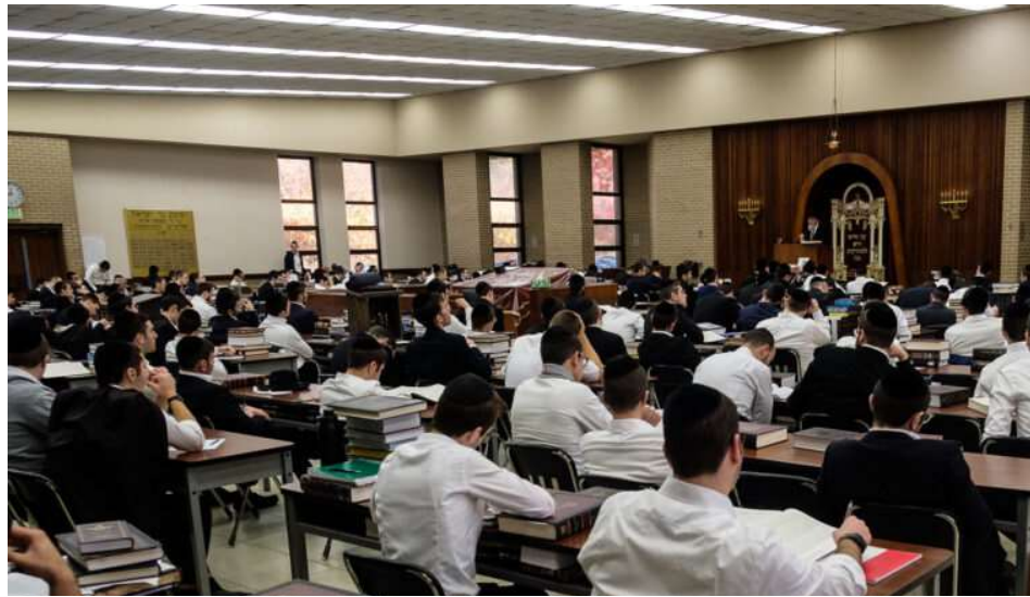
Students Listening to a Lecture in the Tanenbaum Bais Hamedrash

Detailed information regarding meningococcal disease, the availability and effectiveness of any vaccine, as well as an approved waiver are available in the administration building during regular business hours.