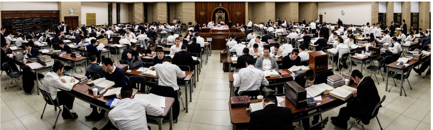
Panoramic View of the Bais Medrash

A candidate for this degree will be required to complete a minimum of 60 credits at Ner Israel. In all cases, the last semester must be completed at this institution.